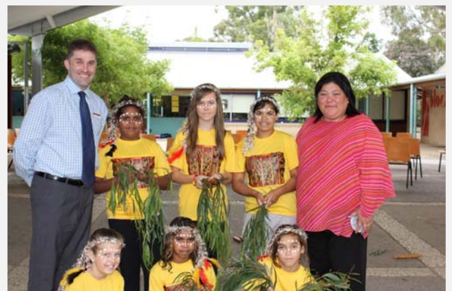
Our Aboriginal Dance Group enjoyed performing during 2011